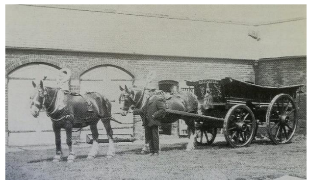
At Model Farm – Ulceby (Thompsons).