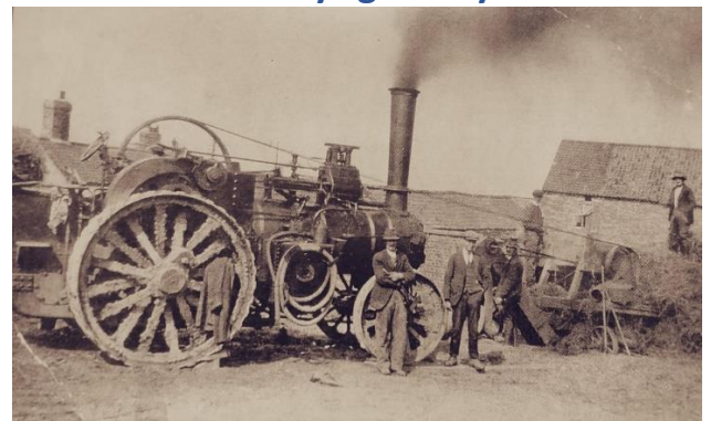
A steam engine at work at Tong's farm, Wrawby, hulling red clover. The Chaff Cutter is a Fletcher from Newport Iron Works Winterton .