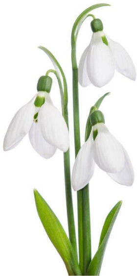
TO A SNOWDROP William Wordsworth