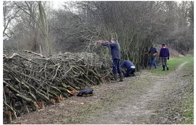
You are never too old to learn a new skill. Volunteers (all retired) laying a hedge at Far Ings.