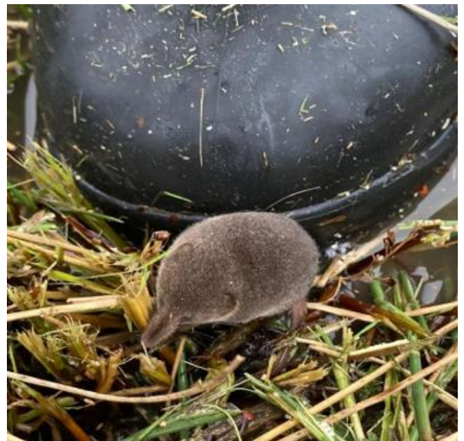
A sleek, fat shrew that has wintered well and survived the threat of a size 11 boot!